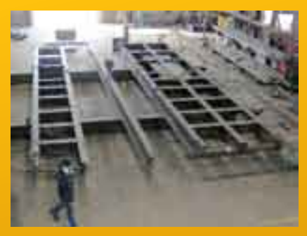
Oklahoma City Packaging Facility Master Skid Fabrication Area