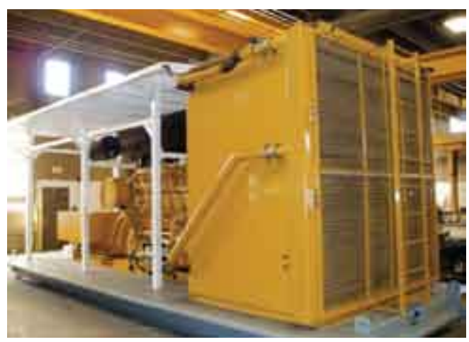
3512C Diesel Generator Set for a Domestic SCR Land Drilling Rig