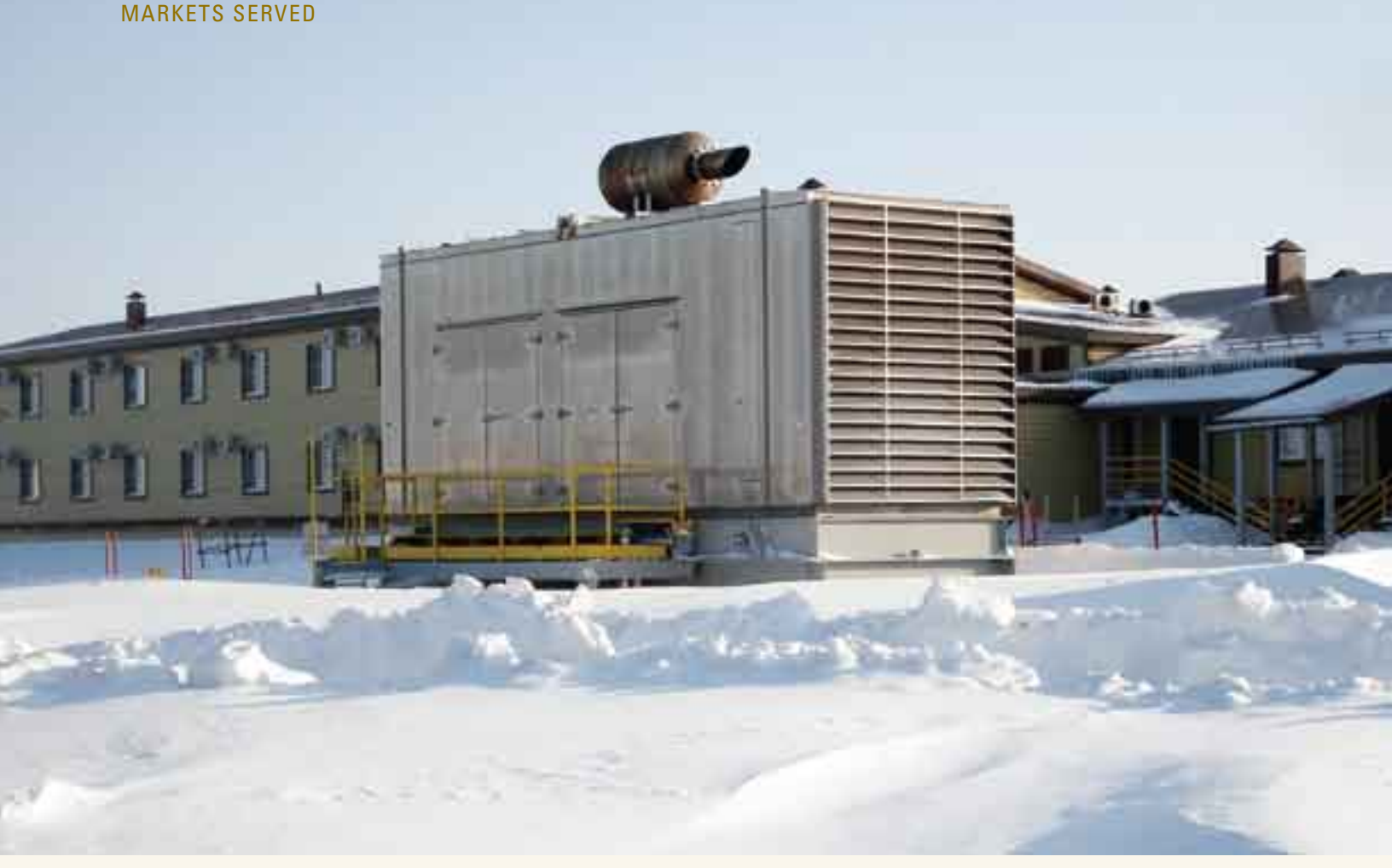
Arctic 3512B Diesel Generator Set - Eastern Russian Federation, fabricated out of Midland PSD