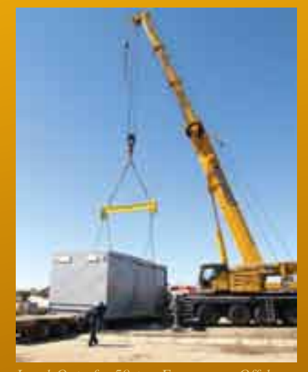
Load-Out of a 50-ton Emergency Offshore 1000 KW Generator Set