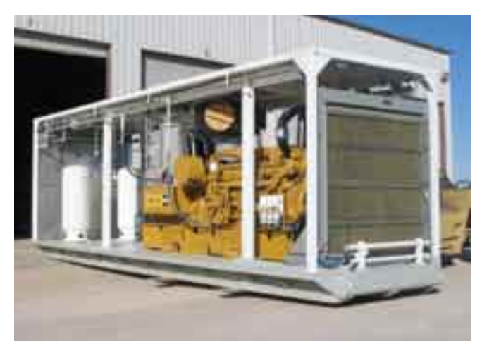
3516B Diesel generator set for an International SCR Land Drilling Rig from our Midland PSD location