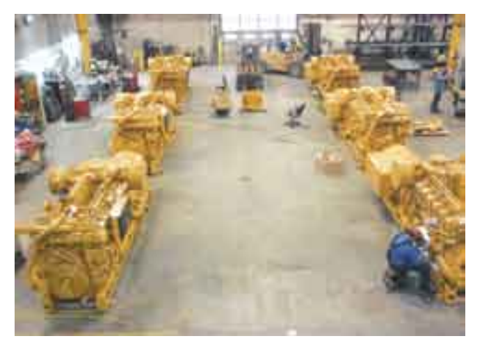
Oklahoma City Packaging Facility - Generator Staging Area